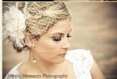
Styptic Moments Photography